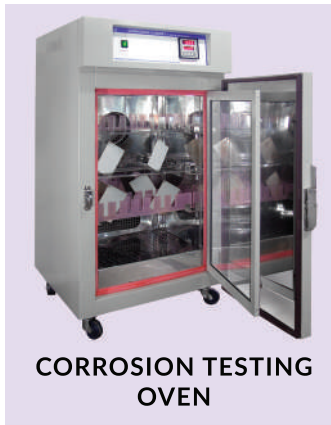
CORROSION TESTING OVEN