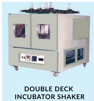
DOUBLE DECK INCUBATOR SHAKER