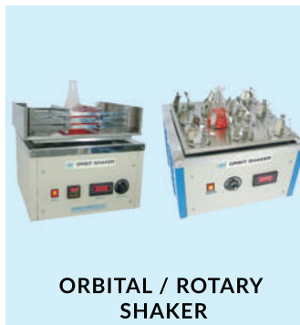
ORBITAL / ROTARY SHAKER