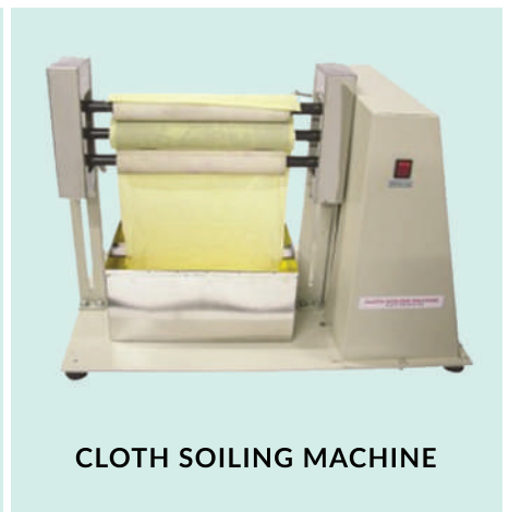
CLOTH SOILING MACHINE