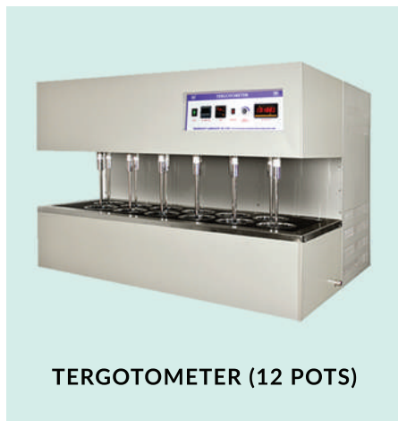
TERGOTOMETER (12 POTS)