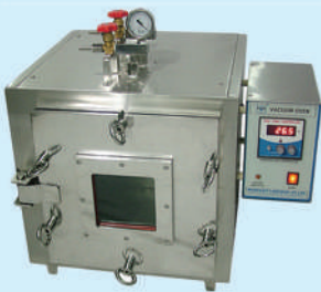
VACCUUM OVEN RECTANGULAR