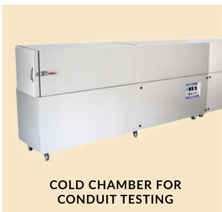
COLD CHAMBER FOR CONDUIT TESTING