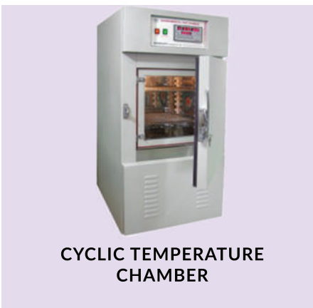
CYCLIC TEMPERATURE CHAMBER