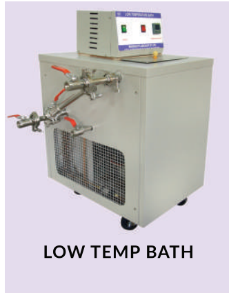
LOW TEMP BATH