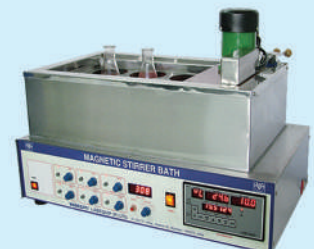
MAGNETIC STIRRER BATH