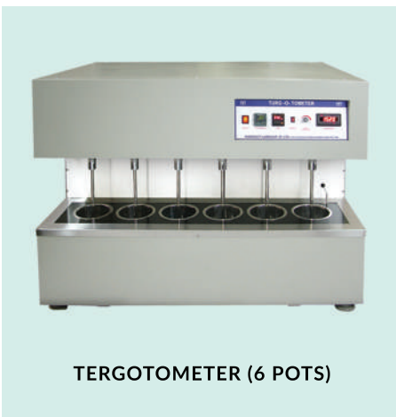
TERGOTOMETER (6 POTS)