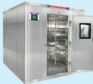
WALK IN STABILITY CHAMBER