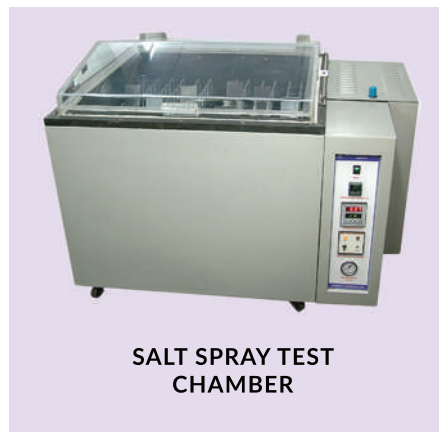
SALT SPRAY TEST CHAMBER