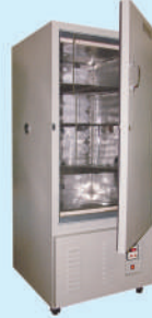
DEEP FREEZER VERTICAL