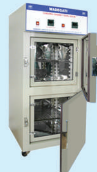
COOLING CABINET DUAL DECK