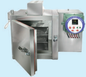
WATER JACKETED OVEN (FLAME PROOF)