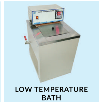
LOW TEMPERATURE BATH