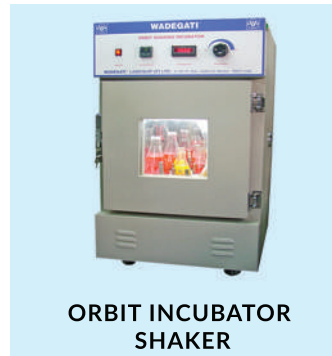
ORBIT INCUBATOR SHAKER