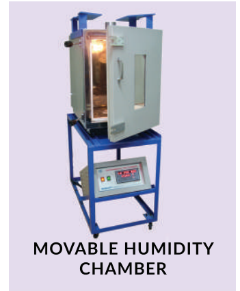
MOVABLE HUMIDITY CHAMBER