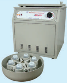
HIGH VOLUME CENTRIFUGE