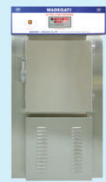
ULTRA LOW FREEZER VERTICAL