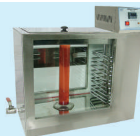
CONSTANT TEMPERATURE BATH