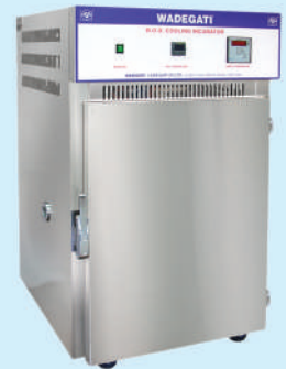
COOLING INCUBATOR (BOD INCUBATOR)