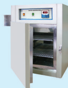
WATER JACKETED OVEN