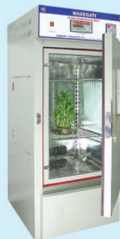
PLANT GROWTH CHAMBER