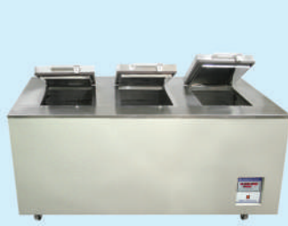
DEEP FREEZER HORIZONTAL