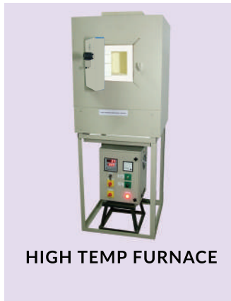
HIGH TEMP FURNACE