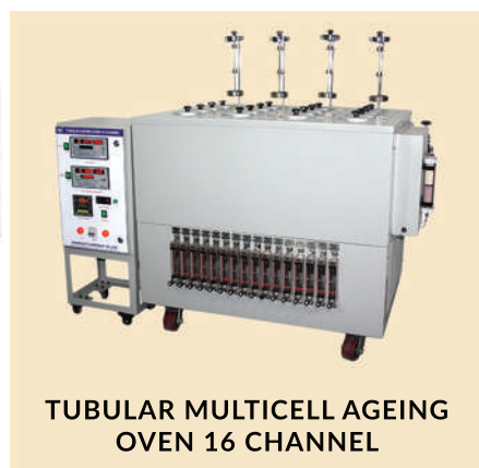
TUBULAR MULTICELL AGEING OVEN 16 CHANNEL