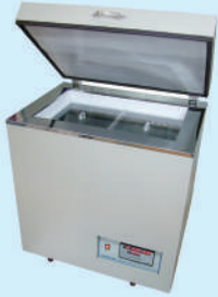
DEEP FREEZER HORIZONTAL